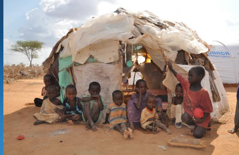
Dabaab, Kenya, 376k