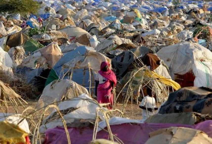
Zamzam, Darfur (170k)