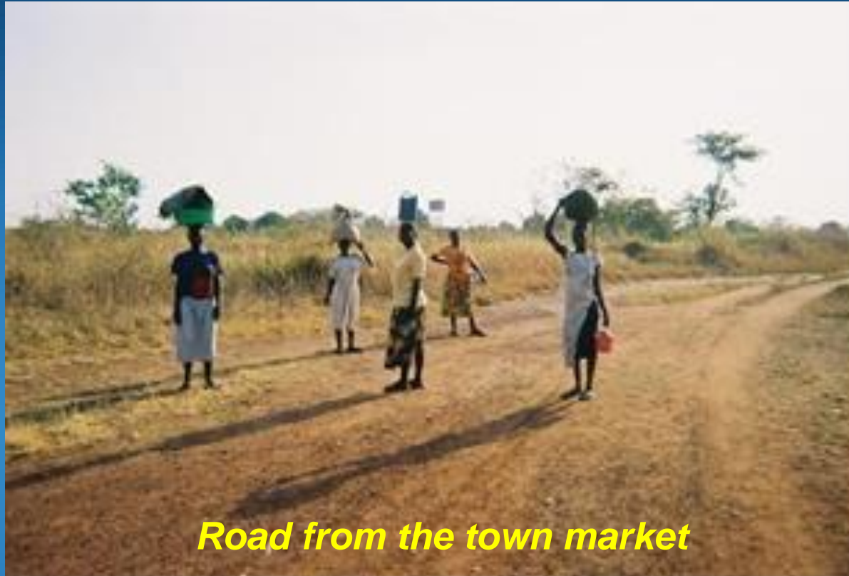
Road from the town market

There have been a number of attacks by an illegal armed group on women taking their goods to the market in a nearby town